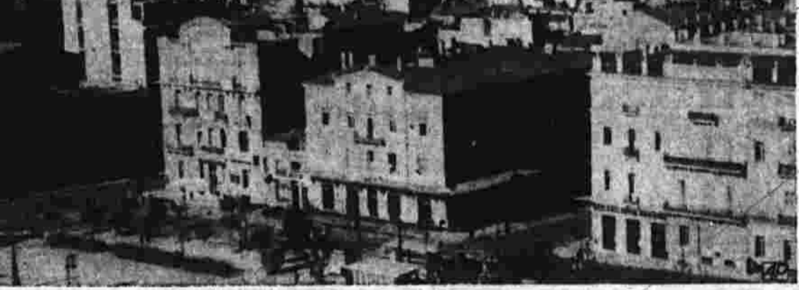
The hill in the background is the Acropolis, citadel of Athens, as it appears from Constitution Square in the heart of the Greek capital. The Parthenon surmounts the Acropolis. Athens fell to Adolf Hitler's legions after 21 days of fighting. The vanquished of Nazi motorcyclists soared into the center of the city and the seafront was promptly hoisted over the Acropolis.

British Report 'Little or No Progress' Made by Invaders Near Salum; No Mention Made of Forces in Greece; Axis Push Recalls Italian Sweep Last September To Sidi Barrani Area.